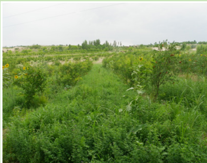
Utilizing artesian source of saline water to produce halophytes - plants which grow under saline conditions

(3 varieties); pearl millet (2), sesame (1), fodder beet (1), maize (2) forage and vegetable legumes (6), topinambur (2), indigofera (1), kenaf (1), atriplex (3), kochia (2).