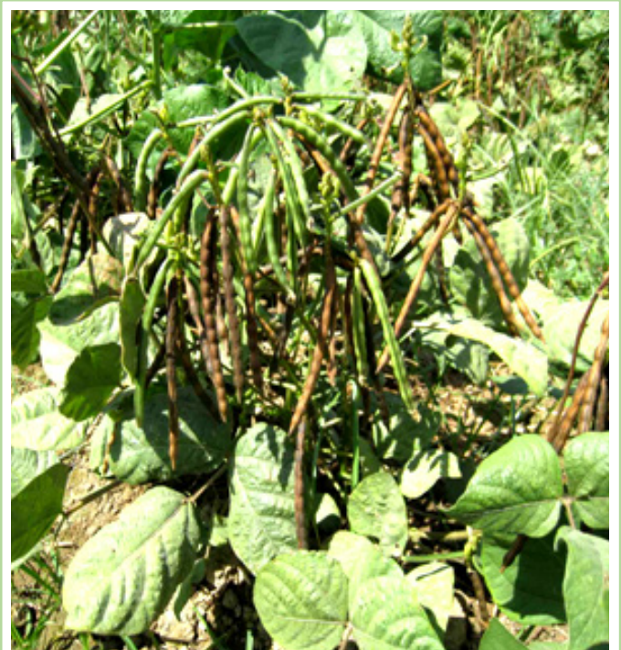
New mungbean (Durdona) variety grown in rice fallow in Karakalpakstan nearly doubled yields and incomes of local farmers, while making soils healthier.

The development of an information database is planned to include crop suitability, crops calendar, and diversification maps to inform stakeholders about best practices for strengthening food and water security in marginal lands. ICBA along with partner institutions will further promote biosaline technologies based on utilization of halophytes as well as water and land management in the area. This will help define improved strategies and carry out field experiments, training of trainers, capacity building for farmers and pastoralists, and support events such workshops and farm-fairs.