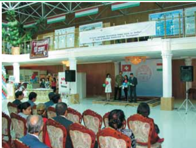
During the Exhibition