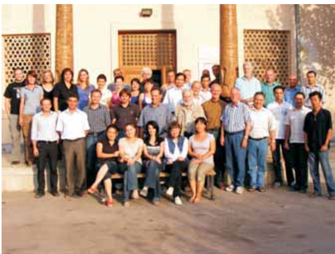
The Evaluation team visiting the ZEF-UNESCO project in Khorezm, Uzbekistan

In the meantime, the project has initiated the dissemination of “science briefs”, short communications that highlight salient research results in a nutshell (see http://www.zef.de/khorezm.0.html , item latest publications), thus addressing a variety of research clients and end-users. The results can be of use not only to farmers and administrators in Khorezm, but also to similar regions in the irrigated lowlands within the dryland zones of Central Asia and the Caucasus.