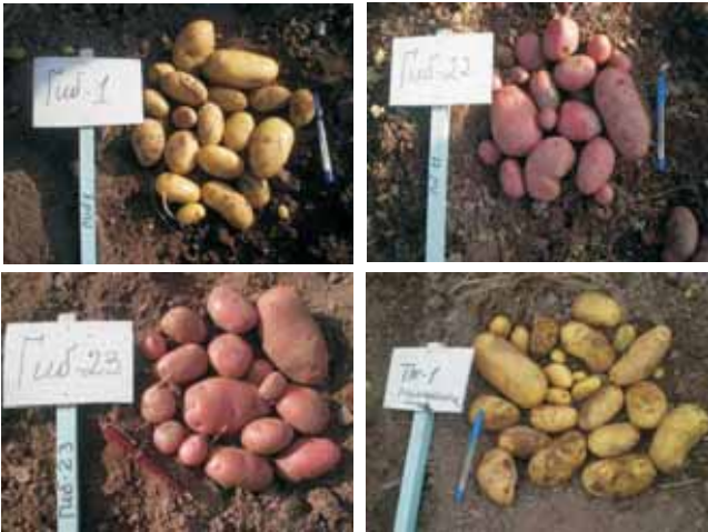
Tubers of TPS family

popular, namely, in the three districts of Faizabad, Vorzob and Jirgatal. Lakshe site, situated in Jirgatal district, was selected because of the possibility to multiply potato clones under disease-free conditions, being located at 2,700 m asl. All the tests were conducted in farmers' fields under farmer's conditions.