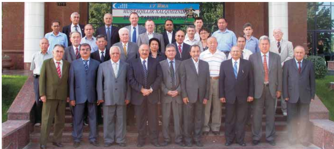
Leaders of Agricultural Research in CAC during the CACAARI meeting