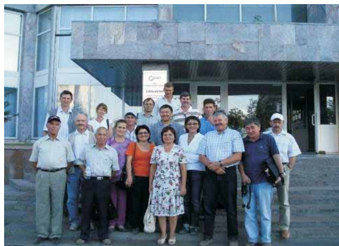
Participants of the Meeting of the Kazakhstan-Siberian Network for Wheat Improvement

on the research results achieved during the last two years of KASIB nursery trials. The results of studies on evaluation of spring wheat samples conducted during the collaborative work have been analyzed. The scientists have highlighted the dynamic development of Kazakhstan-Siberian Network, high economic characteristics of varieties and lines presented by institutions for variety testing, which shows the progress of breeding as well as importance the breeders attach to the activities of KASIB. The attention of breeders was directed at unifying research methods, development of the criteria for distribution of intellectual property rights during hybridization and mutual transfer of varieties, mutual exchange of hybrid populations between