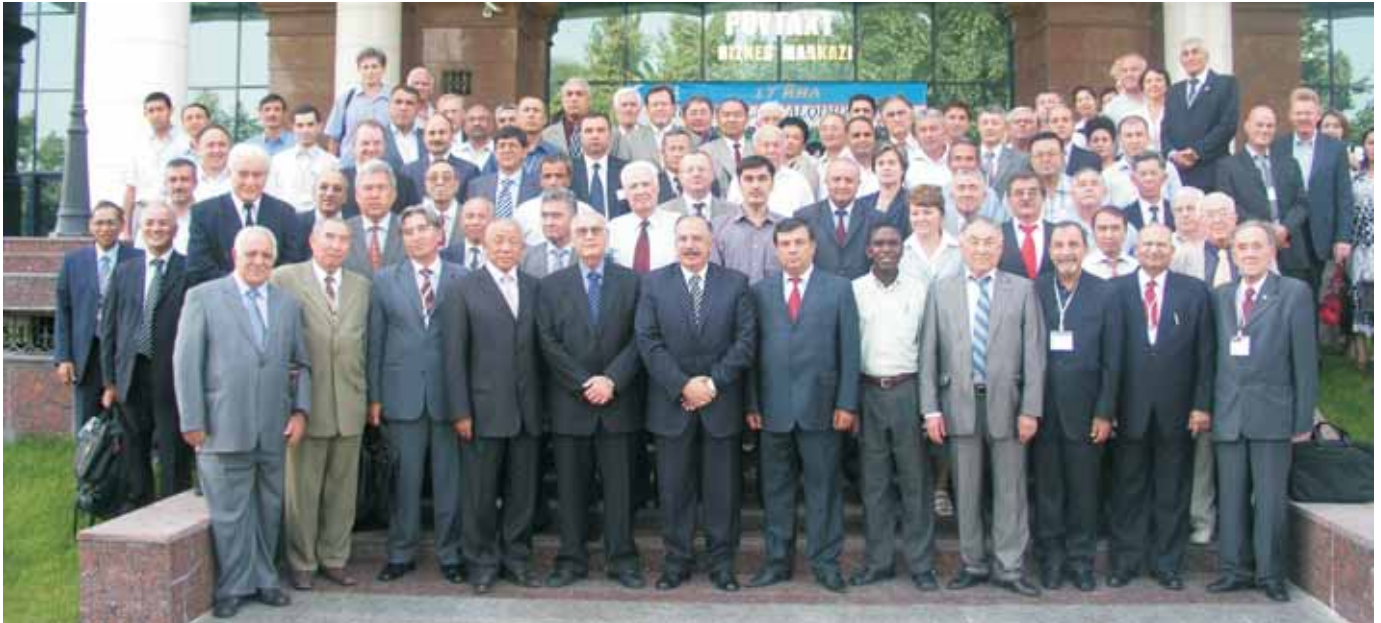
The participants of the International Conference