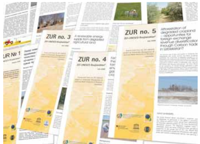
Recent ZUR issues