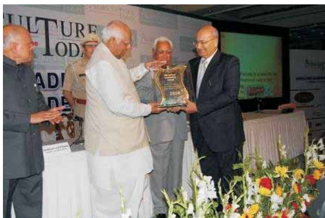
Dr. Paroda receiving the Award from Dr. Somnath Chatterjee, Honourable Speaker of Indian Parliament