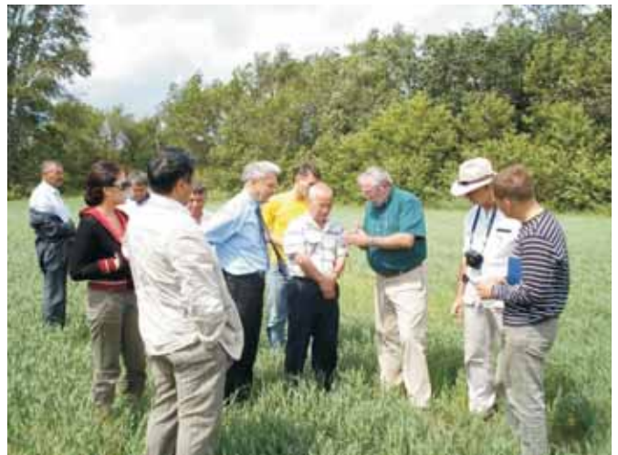
Participants of the International traveling workshop on resource conserving technologies in Central and Northern Kazakhstan

Thanks to the vigorous activity of the international centers and organizations, scientific research institutes, advanced farmer holdings and companies as well as the support of the Government the area under zero till technologies have reached 1.3 mln ha in 2008 and such areas are continuing to grow.