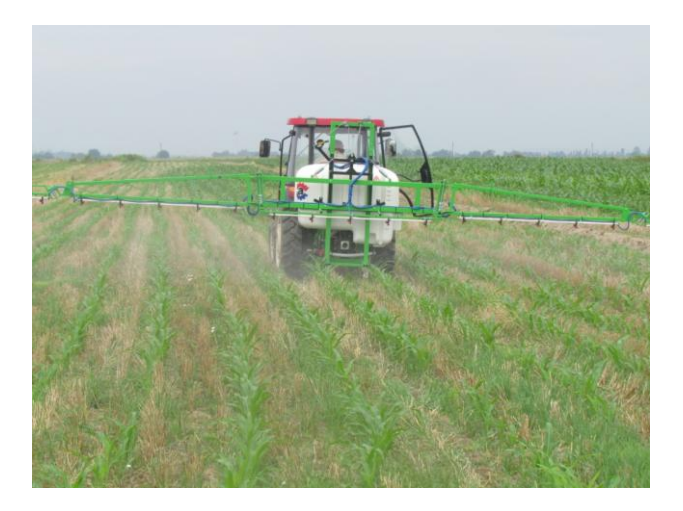
Figure 9. Spraying herbicides to manage weeds

Traditionally, herbicide application in Central Asia is done largely with air blast sprayers, therefore there is limited knowledge of other types of sprayers such as rotary plate, boom, ultralow volume that produce different sizes of droplets. In CA, boom sprayers are widely used, which are fitted with different types of nozzles to target leaves. Exploitation of boom sprayers requires good understanding of nozzle types, angles produced by nozzles to insure good coverage, pressure, preparation of solutions to name few. There is also a need for improving legislation and developing the national capacity on pesticide applying equipment registration, inspection and operator licensing.