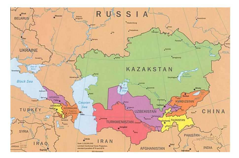
Figure 1. Map of Central Asia

At the Regional Workshop in Antalya, it was agreed that there was a need to facilitate follow-up work on the formulation of country-specific policies, strategies and action plans for the promotion of CA. As a guide to this follow-up work, a regional strategic framework for CA in the Central Asia region has been included as an Annex to be used as a 'road map' (Annex II).