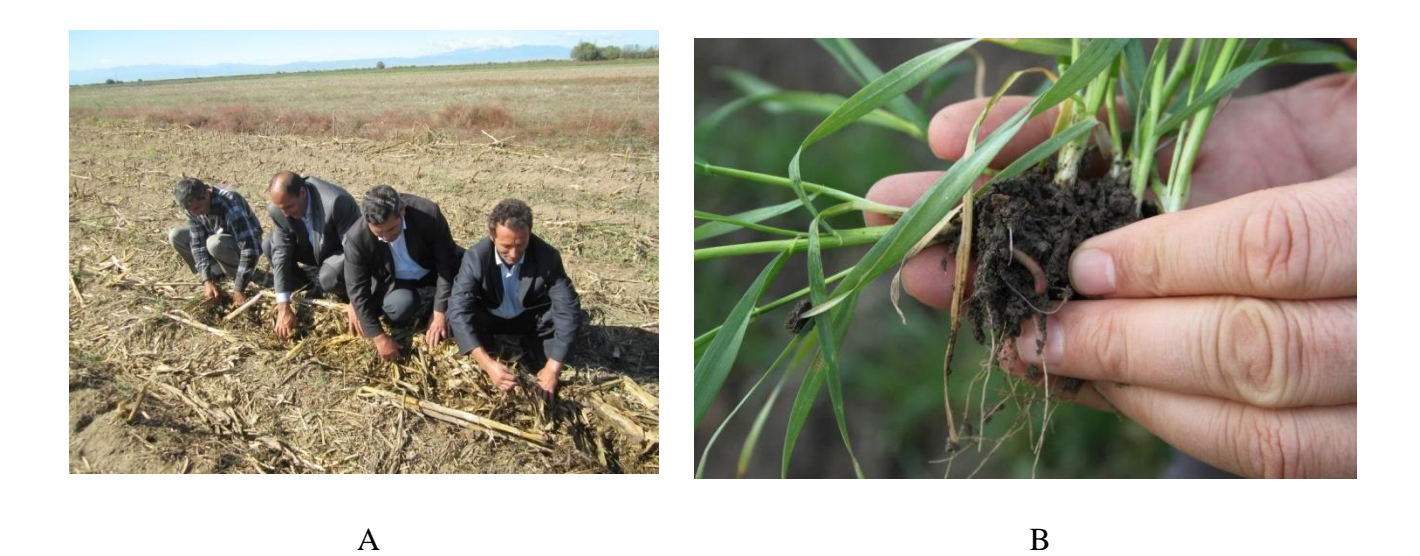
Figure 7. Covering soil surface with crop residues allows improvements in soil moisture (A) and health (B)

In Kyrgyzstan, there has been similar research on CA in raised beds with similar benefits. There are now some 300 hectares of no-till wheat in Kyrgyzstan, and more adaptive research linked to extension activities is being planned for the future with FAO and other partners.