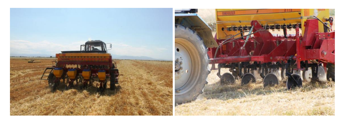
Figure 4. No-till planting under irrigation in Azerbaijan

Of the seven Central Asia countries, only Kazakhstan, Uzbekistan and Azerbaijan have farmland under CA, but all the countries are keen to promote the transformation of their agriculture from tillage-based systems to CA. In Turkey, research on no-till system including with raised beds has been carried out over the past two decades with favourable results in different parts of the country, and there are locally manufactured direct seeders, but there does not seem to be any systematic effort directed towards the dissemination of CA (Gultekin, 2012). It appears that in Tajikistan (Muminjanov and Sanginov, 2012) and Kyrgyzstan, some elements of CA can be found within several donor funded projects implemented in the past. However, their geographic coverage and number of beneficiaries (mostly farmers) are relatively small.