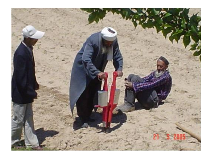
Figure 8. Adoption and promotion of CA requires proper tools such as jab planter

In Turkey, there has been considerable research done on no-till and CA systems with results generally similar to those obtained in Azerbaijan and Kyrgyzstan but there has not been a serious attempt to promote the dissemination and adoption of CA. This is beginning to change and projects are being formulated and implemented that aim at the introduction and adoption of CA. Turkey already manufactures no-till direct seeders that are exported to countries within the region and beyond.