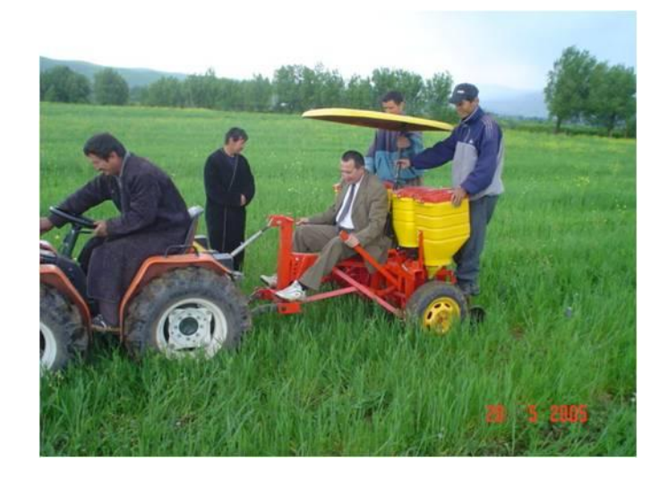
Figure 5. Testing no-till drill in Tajikistan

According to the Ministry of Agriculture of Kazakhstan, in 2011, no-till and conservation tillage practices were introduced on an area of 11.7 M ha, which is 70% of all the area sown to wheat in Kazakhstan (Sydyk et al., 2008, cited in Nurbekov et al., 2013). In 2011, the country harvested record gross yield of grain of 20 M t corresponding to a yield of 1.7 t ha<sup>-1</sup> (Sydyk et al., 2008). These results were achieved due to the introduction of CA practices, although the area under full CA in Kazakhstan is only 1.6 M ha.