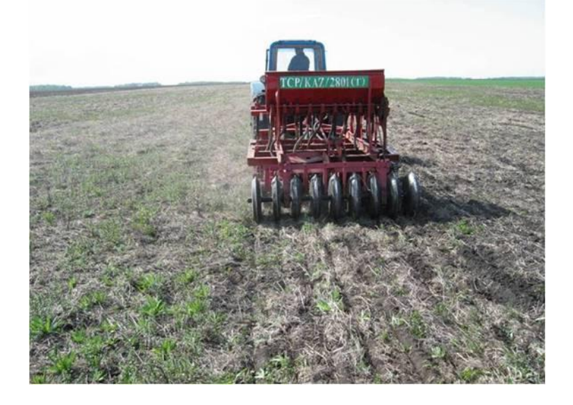
Figure 3. No-till planting under rainfed conditions in Northern Kazakhstan

Adoption and spread of CA practices would need increased information dissemination, awareness, and learning among farmers and policymakers about the benefits of CA.